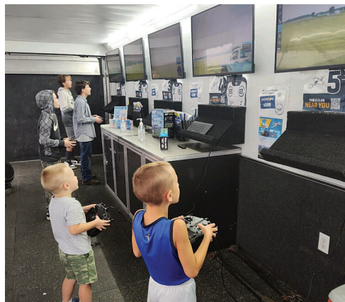
The AMA Model Aviation Experience Sponsored by Wing trailer.

For more information on Brig. Gen. Chuck Yeager, please visit https://chuckyeager.com .